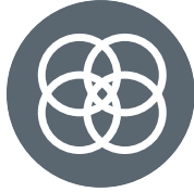
Dye Sub print