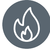
B1 Fire rating

A knitted polyester with black PU rear coating. Our Vision Block is ideal for almost any application where opaque qualities are required.